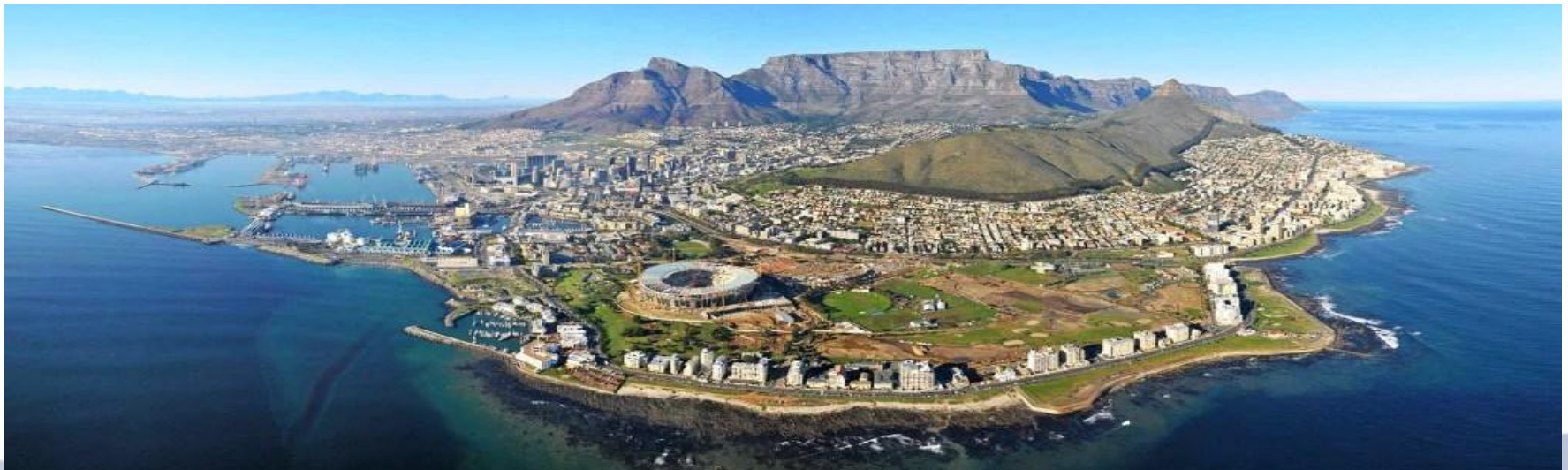
Aerial photograph: Greenpoint Soccer Stadium, Table Mountain