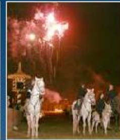
The Firework Display