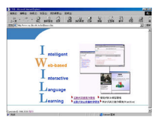
Fig. 3 Intelligent Web-based Interactive Language Learning (http://www.can.tku.edu.tw/IWiLL)

Details on the specific components of the system, such as the VOD, online synchronous tutoring, and web-based composition environments can be found in a series of papers on the system as well as our web site http://www.can.tku.edu.tw/iwill. The focus of this paper has been the overall system integration. The emphasis has been that technology has been applied carefully with top priority given to considerations of the user. More specifically, we have taken care to design a system that incorporates insights of linguistics concerning what language learners need. The result is a system which encourages learners to learn by doing, not just to passively memorize rules and vocabulary. Learners can use English for communication in an online environment that offers feedback and plentiful authentic input adjusted to their needs and their level.