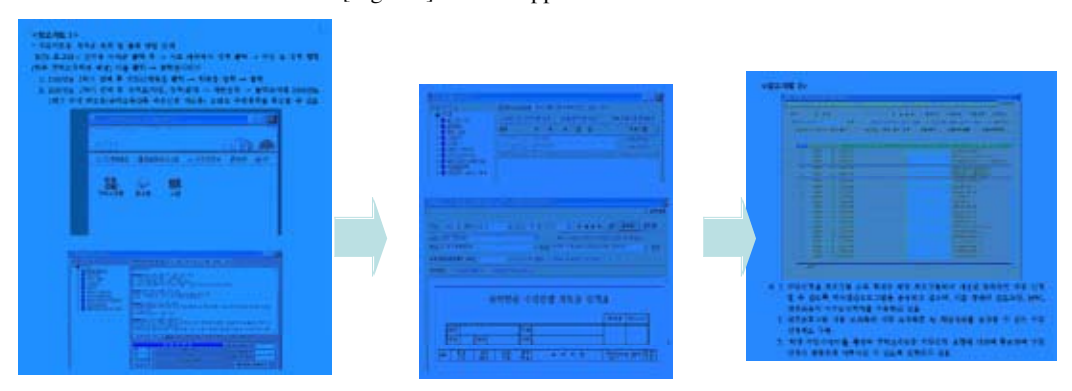
[Figure1] Course Application Procedure