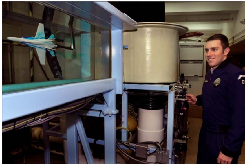
Figure 4. Water Tunnel

In support of the computational education and research mission, the Department manages a SGI Altix ICE 8400 parallel processing computer system with 144 core processors, 2GB RAM per core and 6TB common RAID storage. This local capability is in addition to access to the large national HPC sites through the Defense Research Network. The Department has active computational research programs in virtual flight testing and system identification, aero servo optics and closed loop flow control and is the principle investigator of a 7M cpu hour U.S Department of Defense High Performance Computing challenge grant.