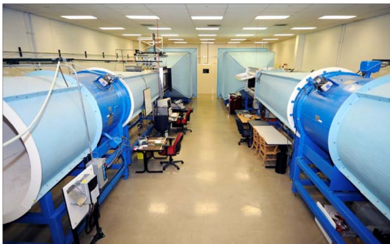
Figure 3. Low Speed Wind Tunnels