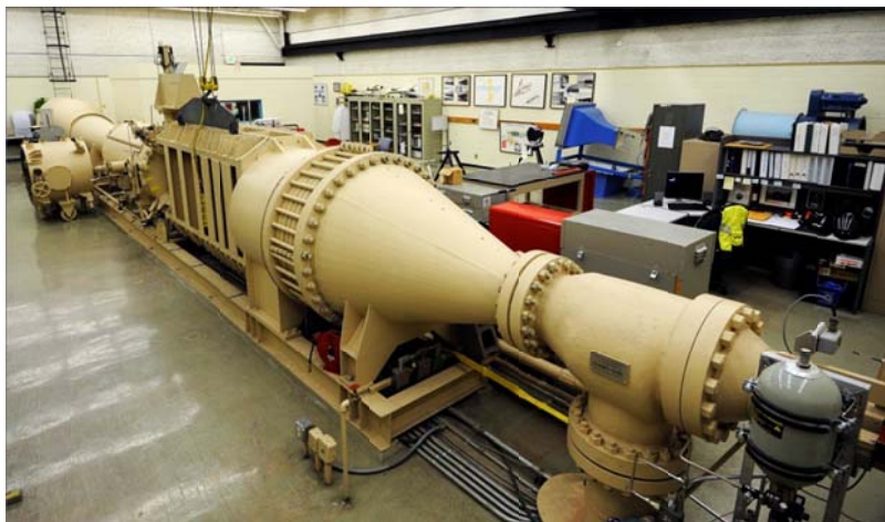
Figure 2 Trisonic Wind Tunnel

Dual low speed wind tunnels as in Fig 3, also with test sections of 0.91 x 0.91 m cross section, complement the SWT. They operate at up to 30 m/s, and their simple, open-return design eases operation, allowing students to run the facility unsupervised. Like the SWT and TWT, they also have a well-developed force and moment measurement capability.