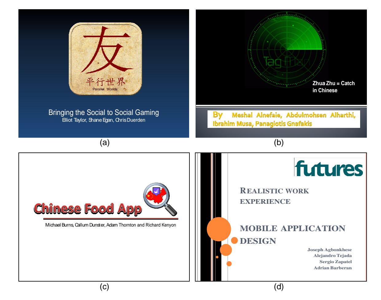
Figure 3 Title slides of group presentations from UCLan students:

Each institution had a judging panel who discussed the students' ideas with them, and finally identified a winning team from each institution. The winning team from UCLan had put forward their ideas for a 'Chinese Food App' (Figure 3c [10]) to help visitors to a new country locate and book a restaurant to suit their tastes and requirements, whilst the XMUT winners had developed concepts for 'HyperVoicelE', software using voice prompts to control an application browser. We propose that the UK winning team members should visit XMUT (and vice versa) in order to get firsthand experience of the international market they had been researching, and possibly develop their ideas further. Funding is currently being sought to facilitate this.