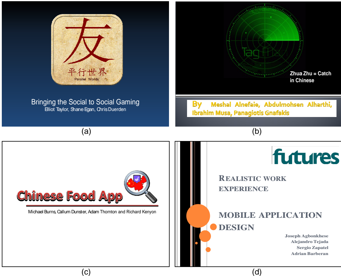
Figure 3 Title slides of group presentations from UCLan students:

Each institution had a judging panel who discussed the students' ideas with them, and finally identified a winning team from each institution. The winning team from UCLan had put forward their ideas for a 'Chinese Food App' (Figure 3c [10]) to help visitors to a new country locate and book a restaurant to suit their tastes and requirements, whilst the XMUT winners had developed concepts for 'HyperVoiceIE', software using voice prompts to control an application browser. We propose that the UK winning team members should visit XMUT (and vice versa) in order to get firsthand experience of the international market they had been researching, and possibly develop their ideas further. Funding is currently being sought to facilitate this.