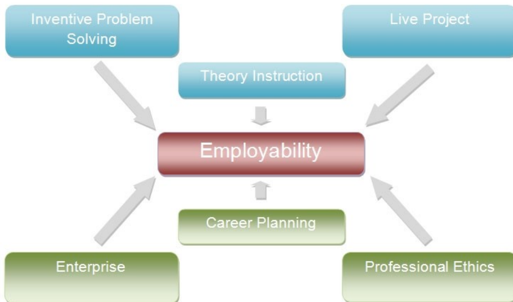
Figure 2 XMUT employability model [1]

The employability model developed by XMUT, and summarised in Figure 2, provides a robust educational framework for the delivery of academic, business-focussed and innovation-led aspects contributing to the development of enterprising graduates. A key element of this framework is the inclusion of Inventive Problem Solving which underpins much of the project-based learning.