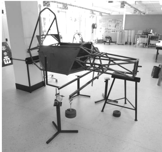
Figure 2: QUT chassis bending and torsion test rig.

The workshop is also equipped with networked computers for the purposes of team communication and car design. They are equipped with standard QUT software including office utilities, solid modeling (SolidWorks™), finite element modeling (e.g. Ansys™) and specialized software packages such as MoTec™ for engine management and data analysis. Sometimes sponsors provide computers with other software packages, e.g. SolidEdge™. The QUT Motorsport team also has access to supercomputing facilities available at the university for the purposes of multi-body dynamics, finite element modelling and computational fluid dynamics. A library of final-year project reports related to QUT Motorsport is also kept in the workshop for access by team members. The project reports reflect the work on the current and previous years' race cars and often include feasibility studies for future design.