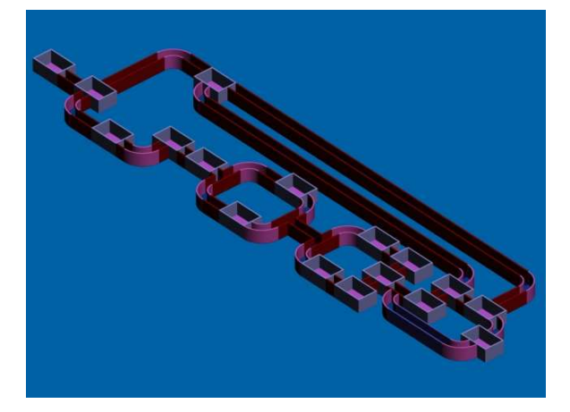
FIGURE 2 A VR SKELETAL MODEL OF ROOMS FOR THE GENERIC FRAMEWORK FOR ADAPTATION INTO INTERACTIVE 3D DESIGN PROCESS MODEL

The model has been designed so that users do not always have to start at the beginning of the model. For example, a student could immediately proceed to the VR design room, if required, where general and specific information could be obtained on this topic for their education.