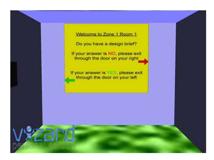
FIGURE 3 REPRESENTATION OF 3D VR ONE ROOM ENVIRONMENT DEVELOPMENTAL MODEL EXTRACTED FROM THE SKELETAL MODEL IN FIGURE 2