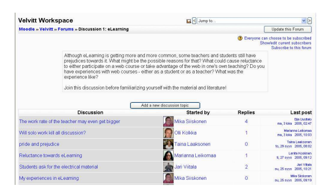
FIGURE 1 DISCUSSION BOARD IN BASIC TEACHING SKILLS MODULE

Evaluating the role of discussion board in electronic based communication we can notice that there might be new roles of students and teachers/facilitator/ mentor/tutor.