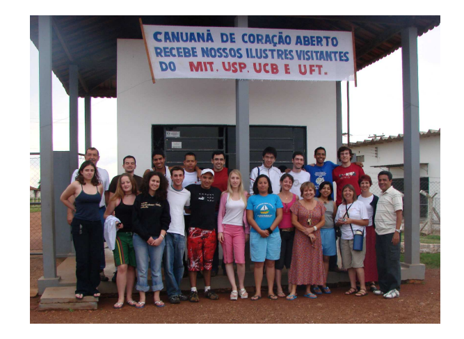
Picture 3 - MIT, Escola Politécnica –USP, UCB (Catholic University of Brasília) and UFT (Federal University of Tocantins) arrival in Canuanã in 2007.

Additionally, we have developed a similar program in Rosinha Slams in Rio de Janeiro, involving MIT and Escola Politécnica. There we have visited some slams, schools and orphanage. Based on the data collected during this visit, it were defined the actions to be taken in order to promote local social development. The activities here performed were sponsored by MODEC.