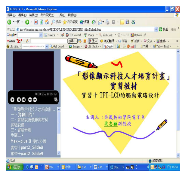
Fig.2 An example of multimedia interactive web-based learning

There are two types of long-distance teaching, namely synchronous and asynchronous types. The synchronous type needs to gather all receiving-end universities to negotiate possible common broadcasting time slots, while the asynchronous type, a modified version of the synchronous type, teachers in the receiving end selects some core parts of the course from the broadcasting end and adds some additional materials by themselves, and edits a new version of teaching material. Meanwhile, Fig.2 shows the asynchronous material of multimedia interactive web-based learning that allows students to review the course material in post lectures.