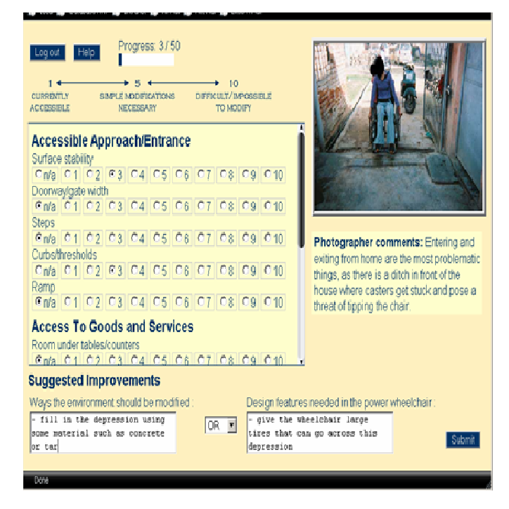
FIGURE 2 WEB-BASED ONLINE SURVEY DEVELOPED BY AN REU STUDENT

Based on the results from this REU project and the second focus group conducted in India, the second generation prototype taking the physical, cultural, technological, and economic constraints into account was designed and constructed. The prototype wheelchair is currently in India and one of our graduate students is conducting field tests and usability studies with the local wheelchair users to identify final design modifications. The long-term goal of this project is to transfer the design to a local manufacturer for production.