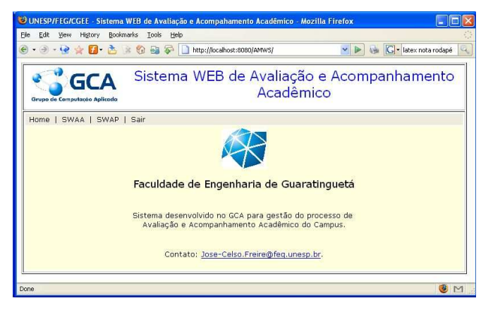
FIGURE 3 SW3A INITIAL SCREEN

The SW3A current development stage is presented below. Figure 3 shows the application's initial screen, from which one has access to all the SW3A modules.