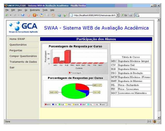
FIGURE 7 STUDENTS' PARTICIPATION LEVELS