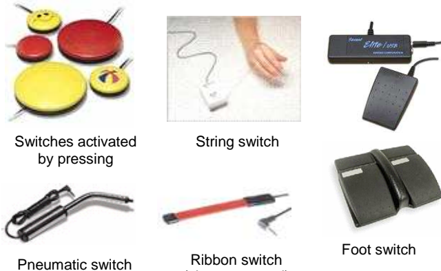
(Sip and puff)

Appropriate sensors are available in a large variety of types and variants. All sensors contain a switch with two positions: active and inactive. Some may have two active positions. The differences in control mode, shapes and dimensions are illustrated in Figure 3. Switch contacts are normally off (inactive) and get on (active state) upon patient's action: hand or foot pressing, muscle flexing (ribbon switch), breathing in or out (pneumatic switch). Switches are connected by means of two wires to a port of the logical control unit (serial, e.g. RS232 or parallel, e.g. LPT1).