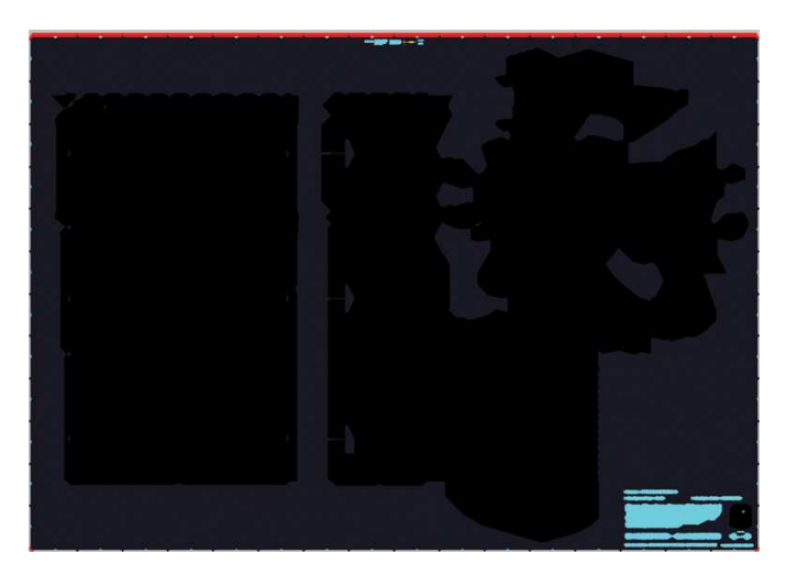
FIGURE 5 DIMENSIONAL INFORMATION SPECIFICATIONS

The improved communications resulted in a considerable improvement in quality of the shipped units received from China, who in turn had implemented a complimentary CAD system to accept the geometry. Following a period of approximately six months the associate had the opportunity of traveling to China to visit the manufacturing plant, some images of the "labour intense production line" are shown in Figure 7.