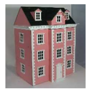
FIGURE 1 THREE STORY DOLLS HOUSE KIT

A product range of dolls houses already existed (and was marketed as "Hickleton Collectors Club"), see Figure 1.