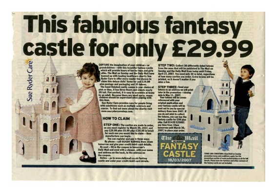
FIGURE 11 CASTLE PROMOTION – DAILY MAIL

The UK launch of the fantasy castle was made in conjunction with a UK newspaper, The Daily Mail. The decision to take this approach as opposed to retailing it through the Sue Ryder shop chain was made in order to obtain high volume sales, but with a reduced margin, see Figure 11.