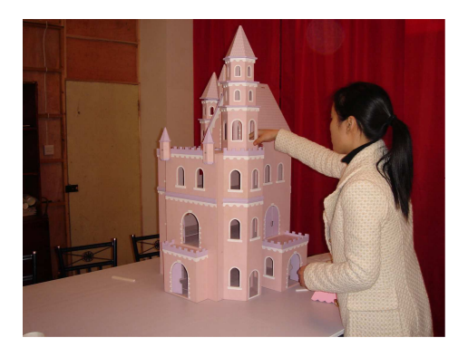
FIGURE 10 CASTLE PROTOTYPE

This prototype allowed the examination of features such as flat pack assembly, in this design the sections of turret nest in order to compact the packaging, see Figure 10.