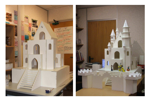
FIGURE 9 CASTLE 3D DEVELOPMENT