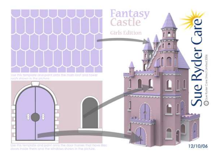
FIGURE 4 COLOURWAY AND INFORMATION SPECIFICATIONS

A solid modeling CAD system was purchased (SolidWorks) on behalf of the associate, and put into operation within Sue Ryder Care, with a view to eliminate misunderstanding of these manufacturing requests.