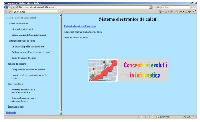
FIGURE 1 CGI IMPLEMENTATION FOR GUIDANCE IN STUDYING A WEB COURSE

enrolled in our distance learning programs (to whom it was particularly dedicated): students sustained that such mechanisms are much more efficient in learning that plain course web sites