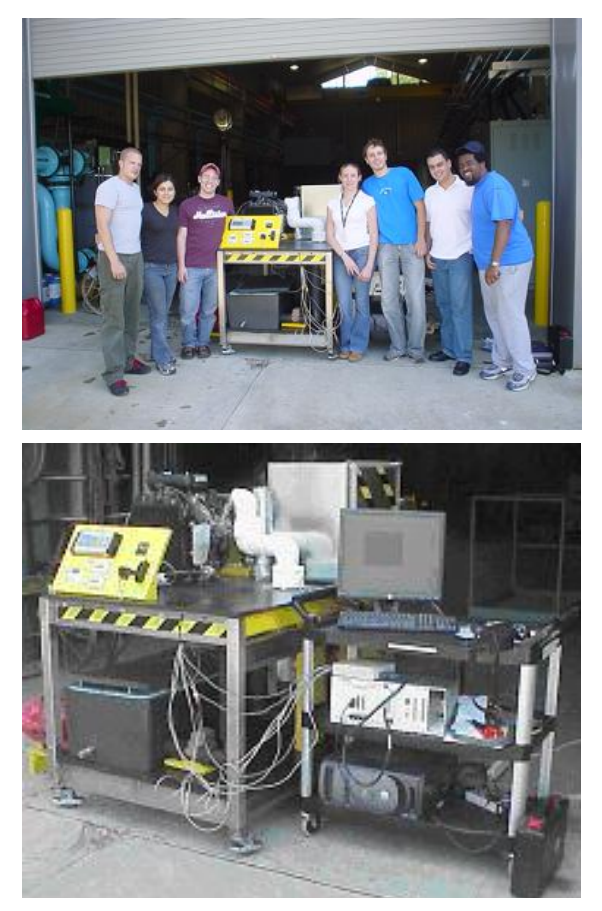
FIGURE 2. EXPERIMENTAL SETUP AND TEAM DURING PRESENTATION (BRAZIL-USA)

In the first year the Brazil-USA team developed a Trigeneration System for Distributed Power, Refrigeration and Hot Water Supply. This project was selected in collaboration between UFPR, the Center for Advanced Power Systems and the Sustainable Energy Science and Engineering Center at Florida State University. The aim of this project was to design and build a prototype of a trigeneration system that will serve as an experimental unit to investigate the potential of tri-generation systems for energy conservation and production. The tri-generation system uses the waste heat from an internal combustion engine to produce hot water and a cold space. Electricity is also produced through an electrical generator coupled to the IC engine shaft.