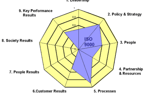
Fig. 2. ISO and EFQM comparison