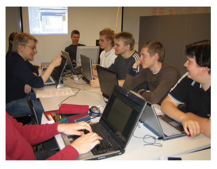
FIGURE 1 A PBL TEAM ROOM

In autumn 2006 the activities moved into new facilities. It was also known that even the other degree programmes there needed team rooms. So, it was feasible to organize three traditional rooms for permanent team rooms by heavy screens. Each slot was supplied by ten tables and chairs arranged in a rectangular shape, a computer, a data projector and a whiteboard or blackboard or at least a flap board. For students' own laptops also extra plug points were arranged. The equipment of one team can be seen in Figure 1.