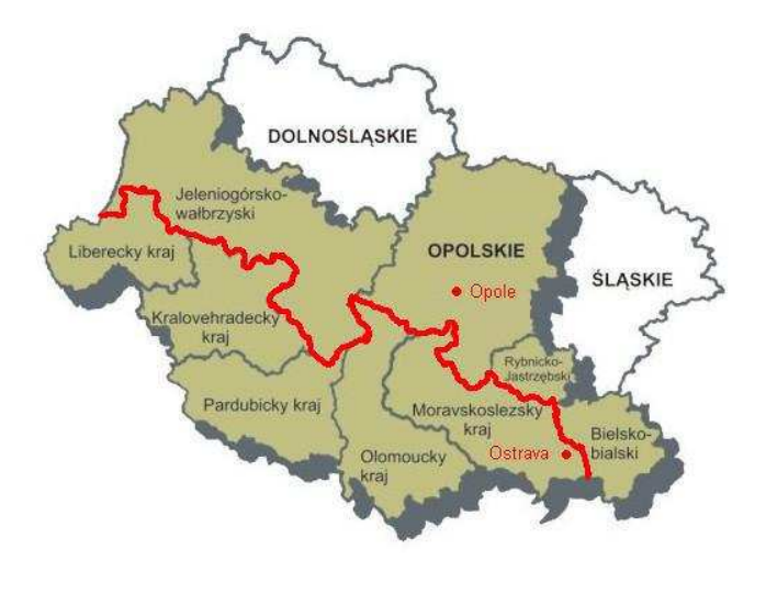
FIGURE 1 BORDER LINE BETWEEN CZECH REPUBLIC AND POLAND

In 2000, years of collaboration have culminated in joint technical projects in the field of rationalization of power usage under the Czech-Polish programme "Kontakt". Collaboration intensified after the accession of both countries to the EU and developed in the pedagogical, as well as research areas. The result of this long-term collaboration is the joint project of the Technical University of Ostrava and the Technical University of Opole on rationalization of power usage (reg. No 21711C5027) under the close-border collaboration programme INTERREG IIIA, which was prepared and approved in 2005 (see attached Figure 1).