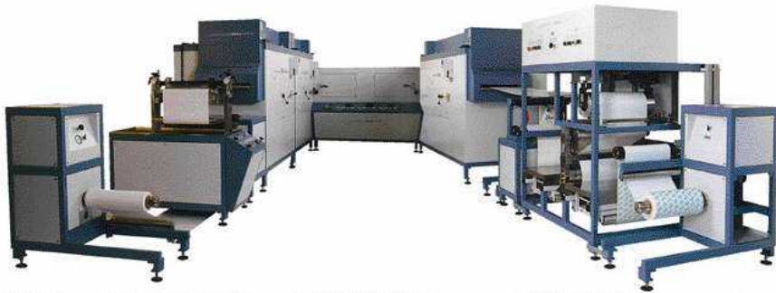
FIGURE 2 EQUIPMENT FOR MANUFACTURE OF TRANSDERMAL PACTCH [5]