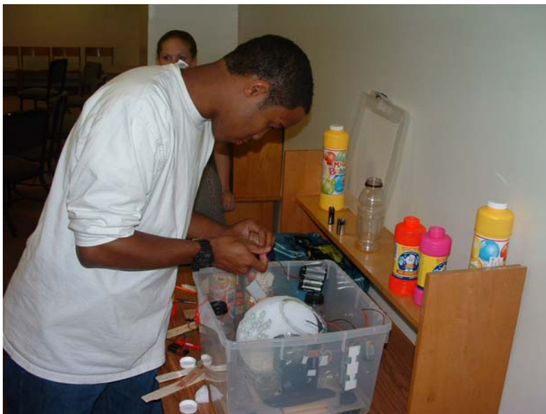
FIGURE 3 FRESHMAN STUDENTS WORKING ON DESIGN PROJECT – PART OF DESIGN PROJECT DOCUMENTS POSTED TO E-PORTFOLIO

In fall 2004 the VTep will be integrated into the first semester Engineering Exploration course with the goals of helping the students see the relevance of all the courses they will take as engineering students, providing a foundation for life-long learning through reflection, and setting the stage for the thoughtful collection of artifacts to support both student learning and program assessment. The ePortfolios developed by the students will include several specific reflective assignments and materials of the individual student's choice that document his/her growth as an engineer over the semester. All (~1300) students enrolled in the first semester GE course will participate in the pilot.