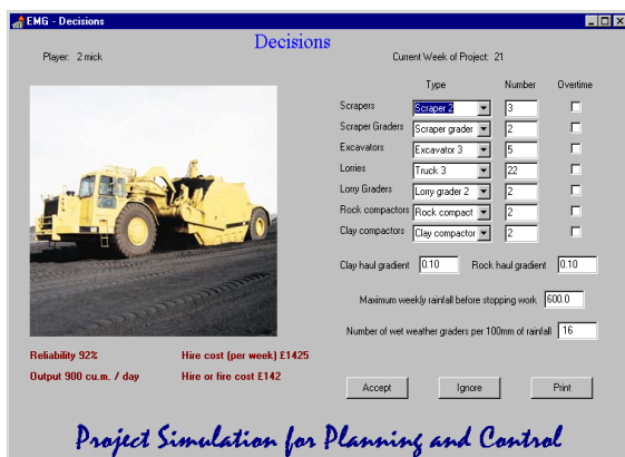
Figure 2: Screen for the selection of equipment