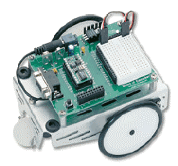
Fig. 2 The Robot (BOE-Bot)

The undergraduate students spent several weeks to become conversant with the BOE-Bot and the associate software and hardware packages. They designed different experiments using the photoresistors, LEDs, and other elements provided with the full kit.