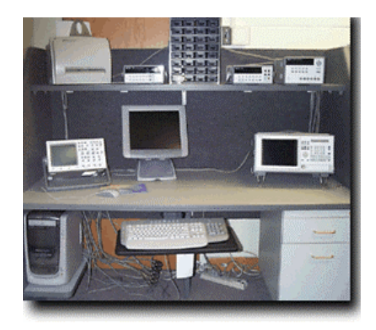
Fig. 1 View of one of the Work Stations in the Electronics Lab

local high school students to the lab for interaction with college students to utilize their assistance in assembling and setting up their robots that stay in the lab. Forth, the project requires high school students involvement after they return to home school by using the donated computers to control and manipulate their robots over the Internet and observe the robot action through the camera. Figure 1 shows one of the five workstations available in the lab.