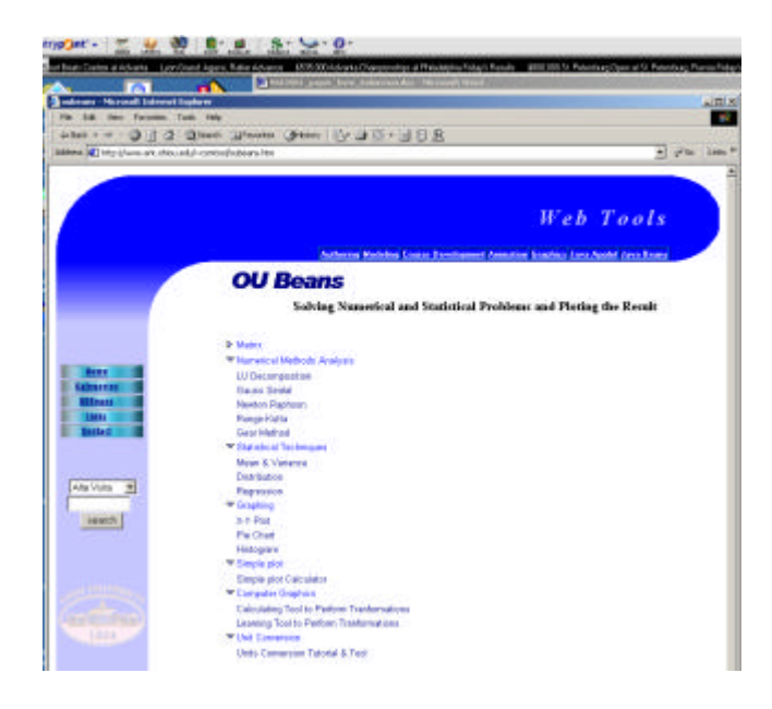
Figure 1: Front end of Web-based Tool-kit <a href="http://www.ent.ohiou.edu/~comtool">http://www.ent.ohiou.edu/~comtool</a> (click on OU Beans)

Beans will not only be able to interface with any other Java program or any Java supporting platform, but will also interface to relational databases and CORBA-complaint ORB's (via IIOP), OpenDoc components, Netscape plug-ins, and Microsoft's ActiveX components. Old legacy applications, which were developed for the mainframe can be interfaced to the beans, thus making it discipline and application neutral also. For example, if one looks at fundamental engineering courses or some physics or math courses, they all deal with developing the governing equation to solve a certain problem.