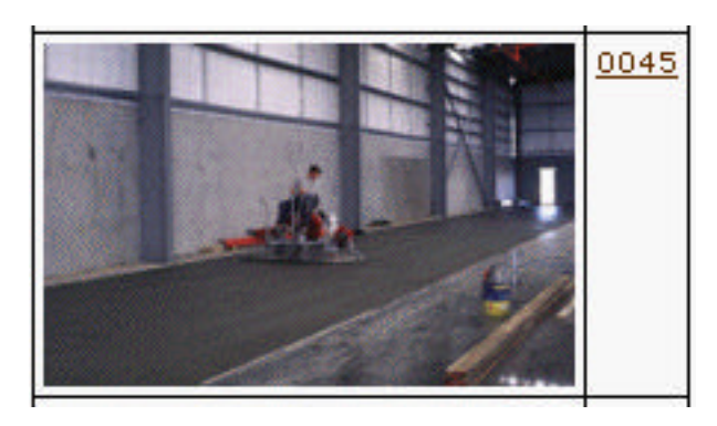
Delivery Strategy & Coordinator's Index Page

Immediate feedback is provided with a response as to whether the answer is correct or not, followed by an explanation for the correct answer. On completion of the online test, the total score is shown and the tally recorded on the coordinator's spreadsheet.