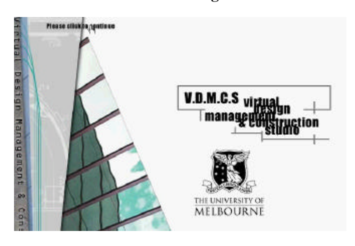
Virtual Design Management & Construction screen