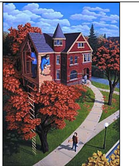
Figure 1: Rob Gonsalves - Tree House in Autumn.

This picture shows a house, which is present in two different planes. The proportions are very different from front to back of the house. The front is a tree house high up in a tree, and the back end is a three story building placed on the ground.