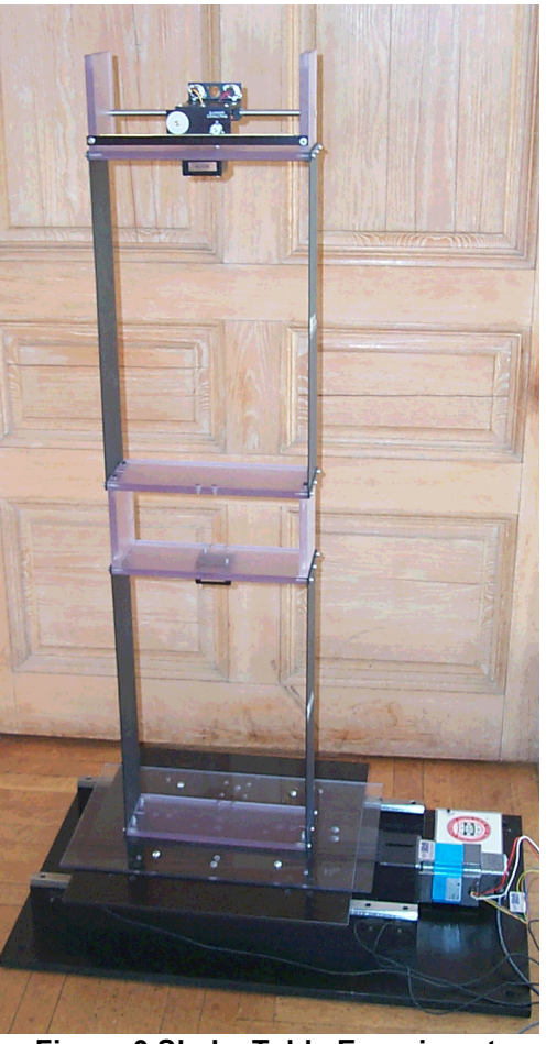
Figure 0 Shake Table Experiment.

The bench scale uniaxial shaking table has a 18"x18" plate, which slides on high precision linear bearings and is driven by a Kollmorgan Silverline Model H-344-H-0600 motor fitted with a 1000 LPR IP 40 encoder. The earthquake simulator uses unit gain displacement feedback, and control is achieved using a CompactRIO real-time system made by National Instruments. The Shaker IV interfaces with a PC through the CompactRIO controller using real-time software implemented in LabVIEW. The CompactRIO is a real-time controller from National Instruments (NI, The http://www.ni.com/). CompactRIO is а combination of a real-time controller, Reconfigurable IO Modules (RIO), FPGA Module, with appropriate general data acquisition capabilities and an Ethernet expansion chassis. The system is linked to a PC and shared variables in Labview are used to allow for remote control and teleparticipation. The operational range of the simulator is 0-20 Hz.