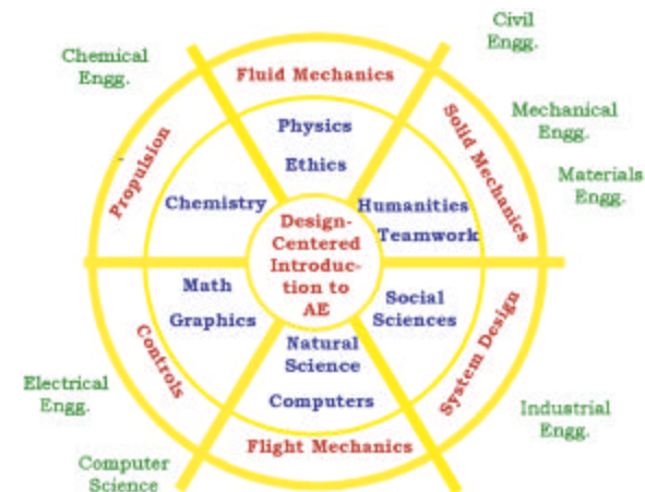
Figure 1: Learner-centered access to the knowledge base from a specific discipline. To the beginning learner, the path to the leading edge of technology lies through an introductory course, the basic sciences, other learning skills, and on through core courses and other disciplines.

1. A design-centered portal to the knowledge base that engages the learner's mind, tailored to learners at the undergraduate level and beyond. Immersed in the design process unique to the school, the learner visits each of its disciplines, many times, as demands arise. Guided paths lead to course structures and on to the leading edge of each discipline. This learner-centered structure of an access to the knowledge base is shown in Figure 1.