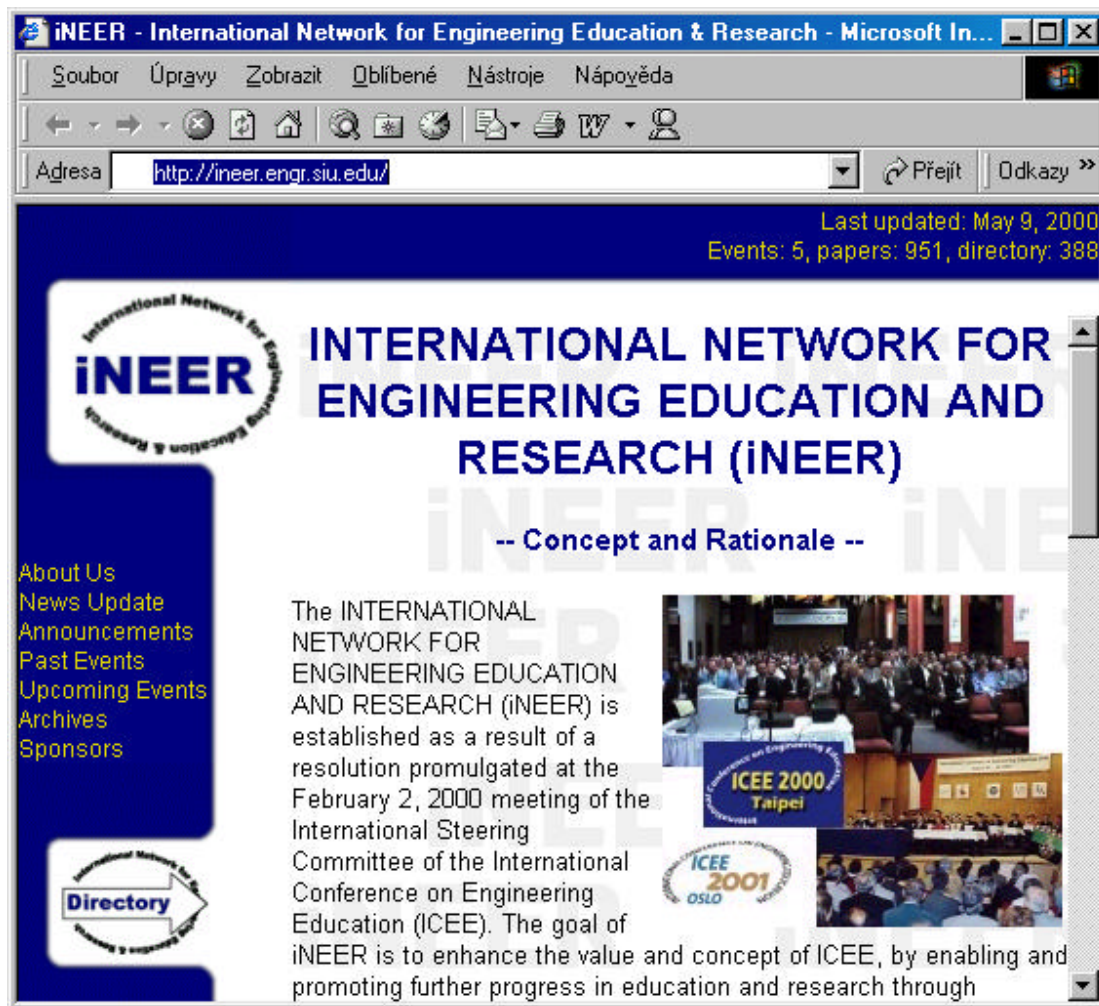
Fig. 1. The iNEER Home Page