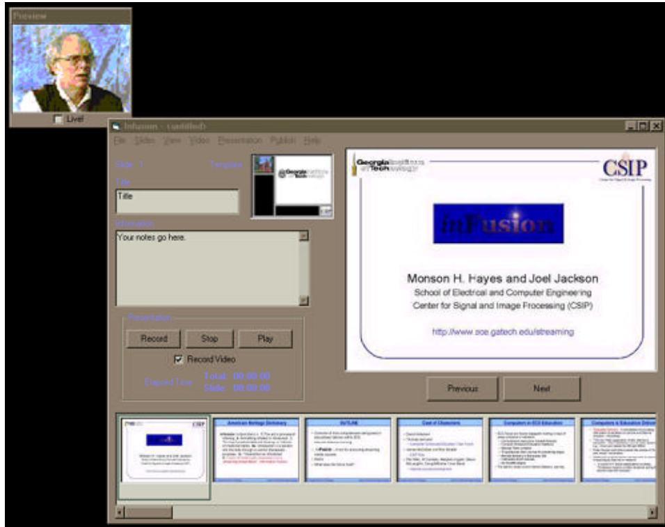
Fig. 1. The user interface.

The instructor needs to provide only postscript files containing the slides or individual images of the slides in GIF, JPEG or PNG format. Then, with a video camera focused on the instructor, a lecture module that includes synchronized video, audio, images, outline and mouse clicks (for annotation use) is captured to disk. Once the video has been encoded, the tool is then ready to automatically generate all of the necessary streaming media files. An example illustrating the presentation format these files generate is shown in Figure 2. The presentation format is flexible, allowing the user to change backgrounds, the elements included, and the layout. This allows the creation of lectures including only audio, or with additional information in the windows around the slide, thus allowing the instructor to tailor the presentation to his teaching style or the learning style of his students. Any of the media windows can be made “hot-clickable,” with links to supplementary material that change as the presentation progresses. This allows a single window to be used as a “Supplementary Information” window, with extra readings or links that correspond to the portion of the lecture currently being viewed. The primary advantages of these tools are simplicity and portability. Although many of our Internet courses are filmed in a small studio, instructors can capture lectures in their own office, at home, or in the classroom.